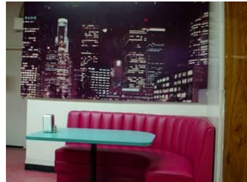
Caption: Los Angeles 1946-1981 promotional image for artist talk.