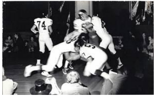
Caption: Preparation F , 1971, John White. Performance at Pomona College Campus Center.

Edmunds Ballroom, Smith Campus Center, Pomona College January 21