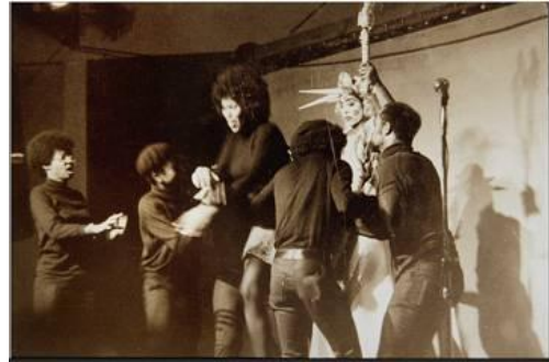
Caption: Bodacious Buggerrilla performing Miss America Piece.

The Bodacious Buggerrilla: A Reprise Performance and Conversation Harold M. Williams Auditorium, the Getty Center January 18