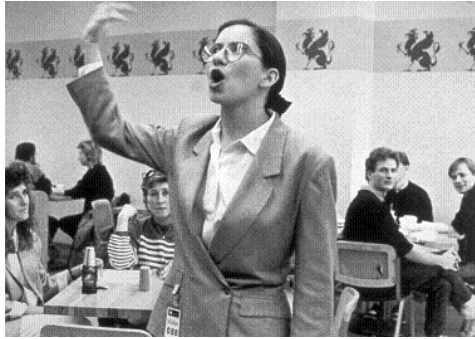
Caption: Museum Highlights: A Gallery Talk , 1989, Andrea Fraser. Performance at Philadelphia Museum of Art.

Men on the Line, KPFK, 1972 National Center for the Preservation for Democracy January 23