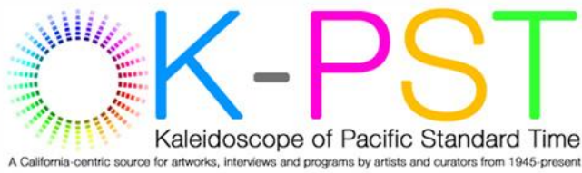
Caption: K-PST logo, designed by Ian Paul.