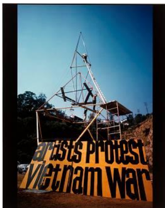
Caption: Artists' Tower of Protest , 1966, designed by Mark di Suvero.

Artists' Tower of Protest On a vacant lot at Sunset Boulevard and Hilldale Avenue January 19-29