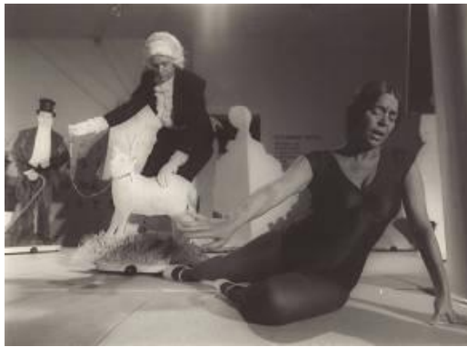
Caption: Eleanor Antin as Eleanora Antinova in Before the Revolution at the Santa Barbara Museum of Art, 1979. Image courtesy of artist and Ronald Feldman Fine Arts, New York.

Before the Revolution Billy Wilder Theater, UCLA Hammer Museum January 29, 2012