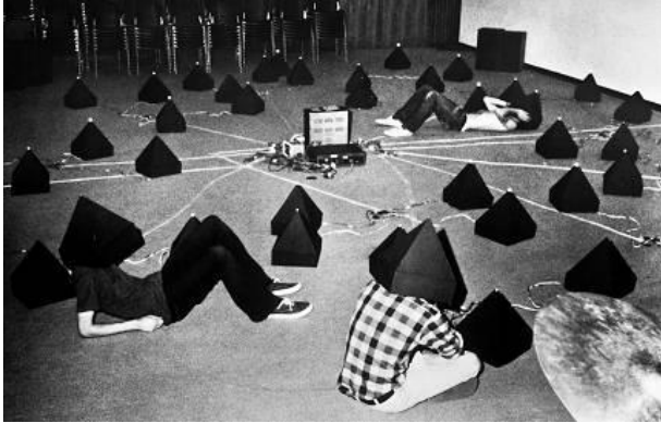
Caption: Members of the Los Angeles Free Music Society testing Pyramid Headphones , 1976. Experimental music performance.

The Getty Center Arrival Plaza January 20