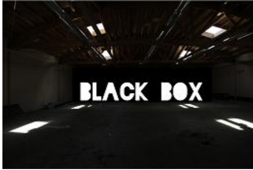
Caption: Black box , curated by Liz Glynn. Nightly official after parties featuring performances. Organized by LA><ART.