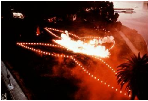
Caption: A Butterfly for Oakland , 1974, Judy Chicago. Pyrotechnic performance. Photo by Donald Woodman. © Judy Chicago.

Merritt Football Field, Pomona College January 21