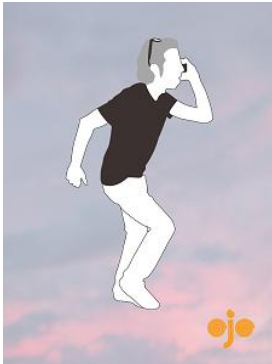
Caption: While Running Sing About Where You Want To Go , 2011, OJO.

Cave Out (In Three Parts, All At Once) Los Angeles Contemporary Exhibitions (LACE) January 26