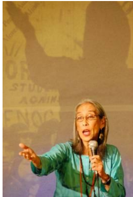
Caption: Nobuko Miyamoto.