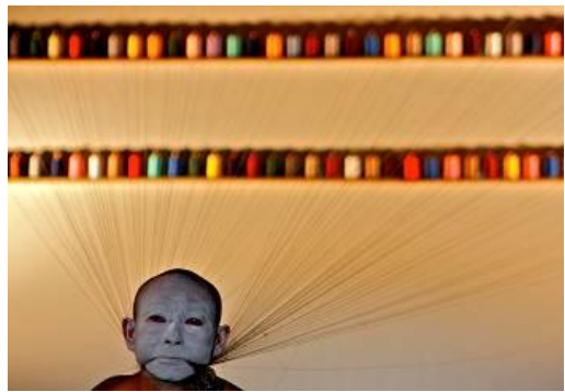
Caption: Oguri performs in Kalpa . Performance and installation.

Kalpa Getty Center Arrival Plaza January 20