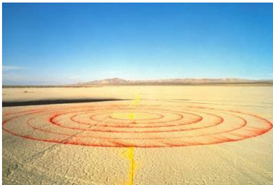
Caption: Spine of the Earth , 1980, Lita Albuquerque. Powdered pigment, rock, wooden rings. Ephemeral installation at El Mirage Dry Lake Bed, CA. Photo by Lita Albuquerque. © Lita Albuquerque Studio.

Baldwin Hills Scenic Overlook January 22