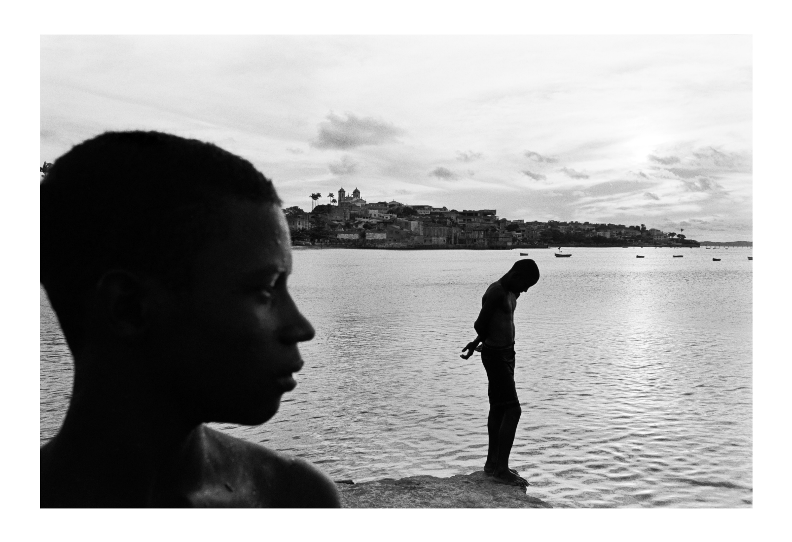
Christian Cravo (Brazil, b. 1974) Salvador, Bahia, 2003