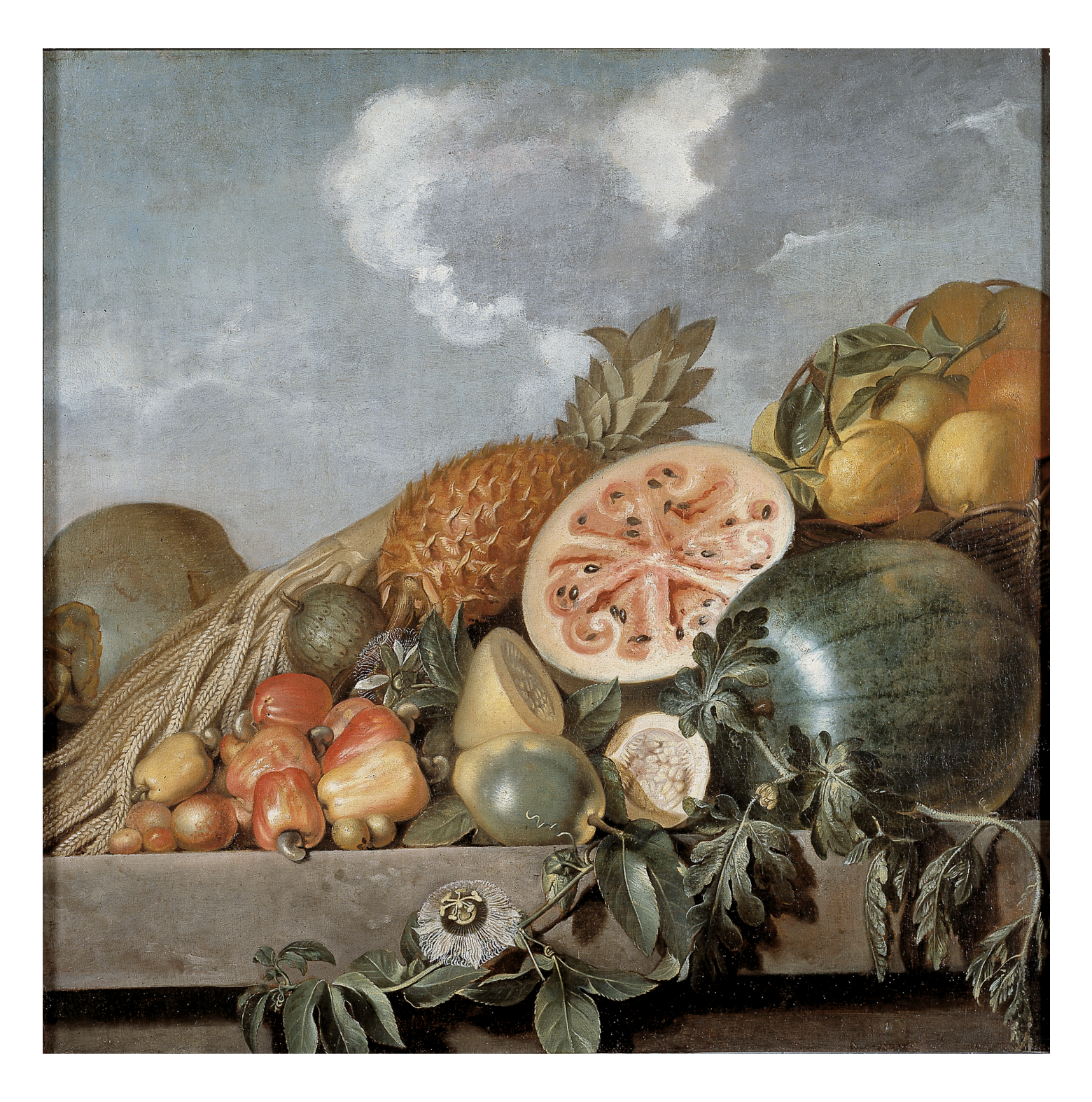
Albert Eckhout (Netherlands, 1610–1665) Fruits, Pineapple, and Melon, etc., 1640–50 Oil on canvas National Museum of Denmark, Copenhagen